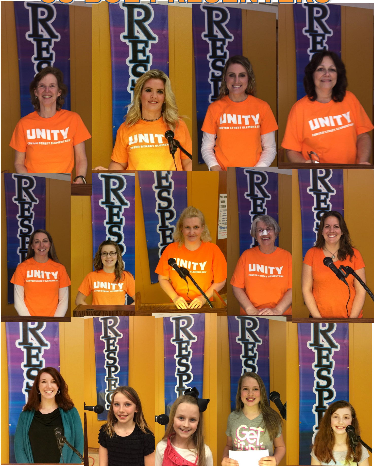
STUDENT COUNCIL/PINT SIZE HEROES